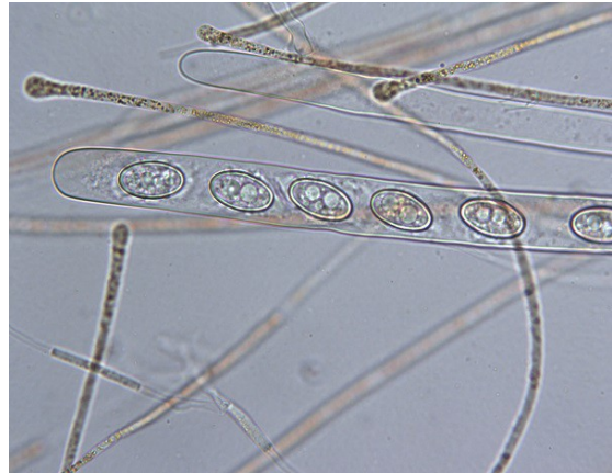
Asci 336 x 19 \mu m. Paraphyses 308 \mu m (capitate - 7 \mu m)