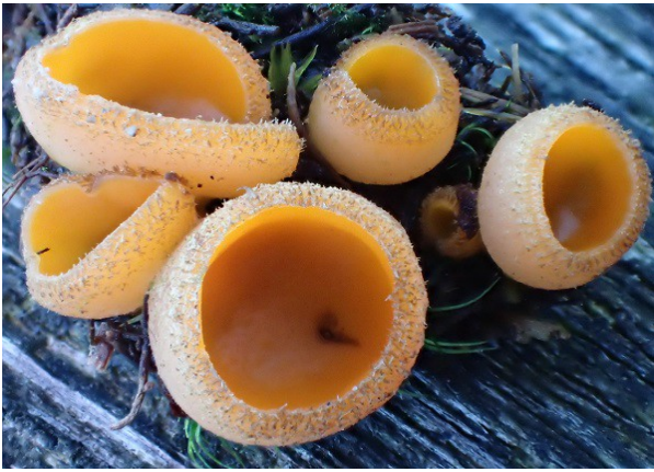
Cup: 0.5 x 0.5 cm