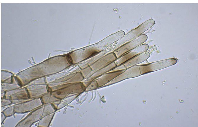
Hairs with blunt tips